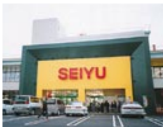
Seiyu Rakuichi (Uenoshiba store)

LIVIN is a new type of department store that emphasizes the enrichment of customers' daily lives. To enhance the selection of lifestyle goods, including imported products, LIVIN stores feature private brands as well as major Seiyu labels such as Mujirushi Ryohin. This maintains the store's focus on clothing, food and home products and increases its appeal and competitiveness. (Photo: LIVIN Yokosuka)