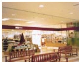
Mujirushi Ryohin (Koriyama store)