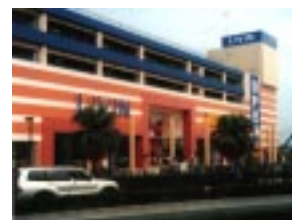
New Lifestyle Department Store LIVIN

Seiyu is currently focusing on the development of Seiyu Rakuichi neighborhood shopping centers (NSC). Seiyu Rakuichi centers in urban areas consist primarily of supermarkets, whereas those in suburban areas are larger complexes made up of a combination of stores for daily life needs, such as supermarkets and drugstores. At the same time, in order to make general merchandise stores (GMS) more competitive, we are working to expand self-service food areas and to introduce more specialty stores such as Mujirushi Ryohin and DAIK. In addition, Seiyu will continue to open new The Mall shopping centers structured around LIVIN department stores.