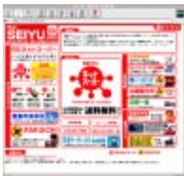
Seiyu Net Super Website

As of February 2001, the delivery area included Suginami Ward, Nerima Ward, Nakano Ward, Meguro Ward, Musashino City, Mitaka City,