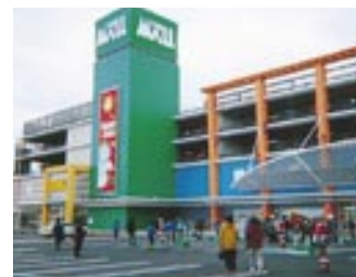
The Mall (Koriyama location)